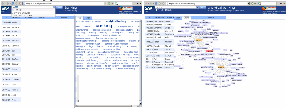
Fig. 1. AJAX auto complete-search, user list, tag clouds, and topic-graph visualization.

Users frequently enter imprecise queries that contain spelling errors or, in the case of names, phonetic variations. By using n-grams the application returns good search results even when terms or names were misspelled or not clearly known. Providing a result set with similar terms, users can quickly identify the correct term even when they are uncertain what they are looking for and initiate browsing from this starting point. Employees usually provide very coarse-grained, generic keywords describing their area of expertise, while users will search for very fine-grained, specific skills [4]. Also, in international organizations like SAP, the spelling of names is not often clear. A meaningful tag cloud of skills is automatically generated as proposed by John and Seligman in [5].